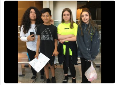
Seventh Grade Field Trip